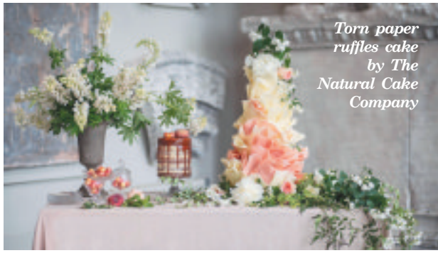
Torn paper ruffles cake by The Natural Cake Company