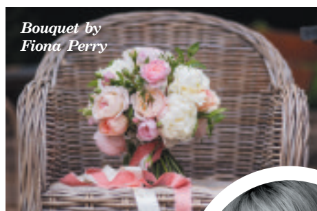
Bouquet by Fiona Perry