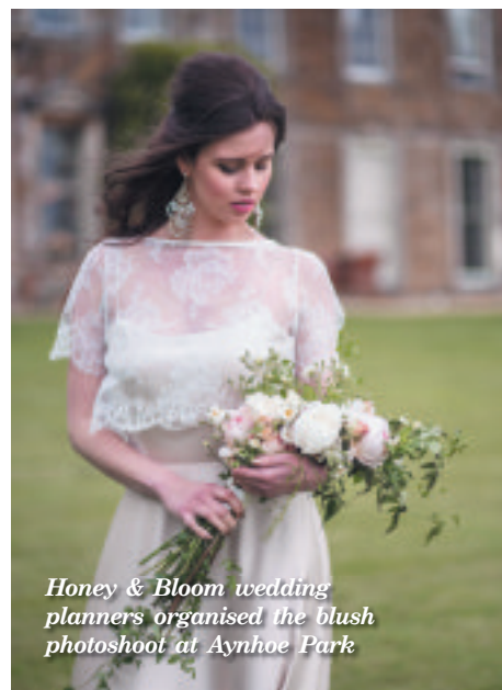
Honey & Bloom wedding planners organised the blush photoshoot at Aynhoe Park