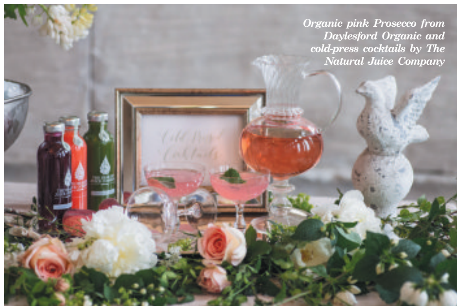
Organic pink Prosecco from Daylesford Organic and cold-press cocktails by The Natural Juice Company